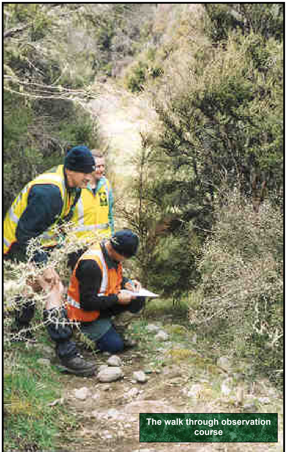
The walk through observation course